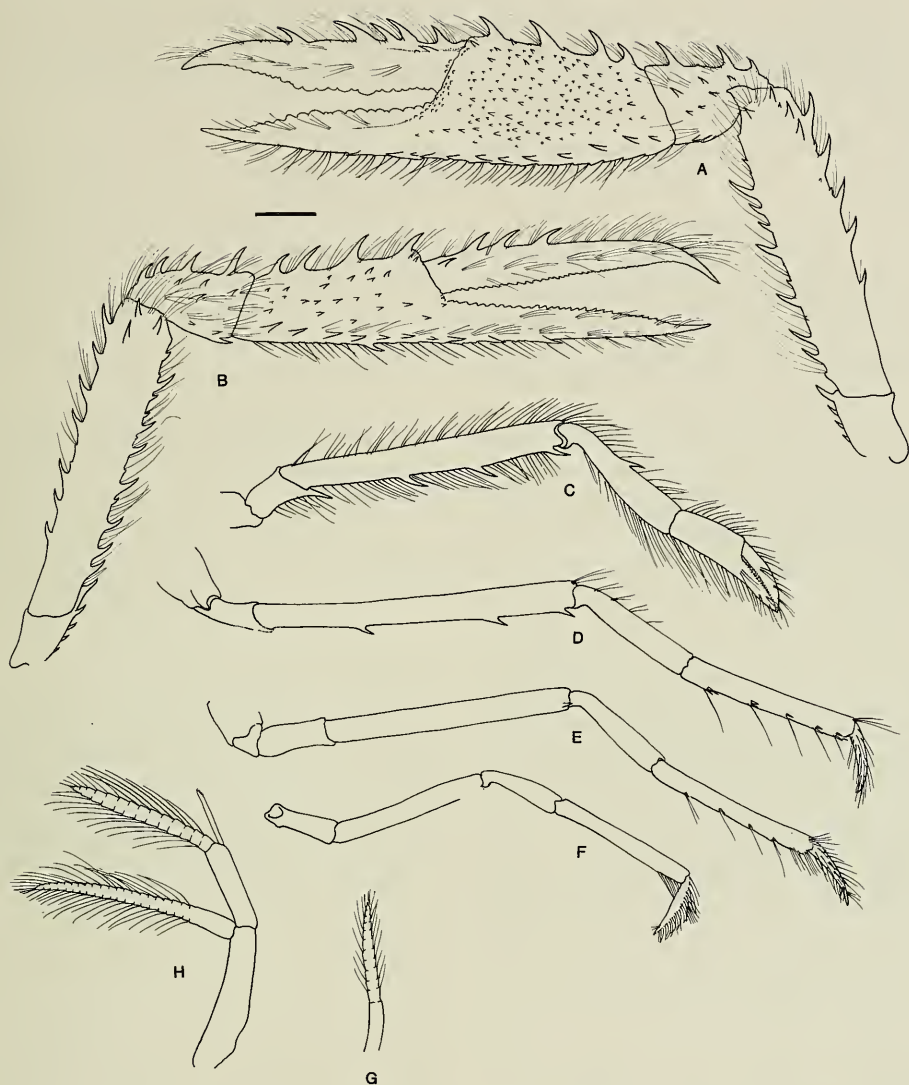
Fig. 2. Acanthaxius kirkmilleri , new species, holotype (USNM 243492). A, Pereopod 1, larger cheliped; B, Pereopod 1, smaller cheliped; C, Pereopod 2; D, Pereopod 3; E, Pereopod 4; F, Pereopod 5; G, Pleopod 1; H, Pleopod 2. Scale (A-F) = 2 mm.

tween this western Atlantic species and the holotype of A. pilocheira (USNM 231418) lie in the lateral ramus of the uropod (lateral margin more spinose than A. kirkmilleri ), the generally more spinose and slightly more robust chelipeds of pereopod 1 in A. pilocheira , and the more elongate telson (1.5 times longer than basal width) in A. kirkmilleri (1.25 times longer than basal width in A. pilocheira ).